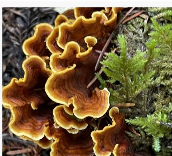
Hairy Curtain Crust ( Stereum hirsutum )